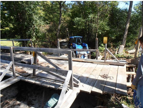
The south end of the bridge was bent sideways by a large tree.