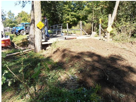
The bridge was raised over a foot and new ramps were built.