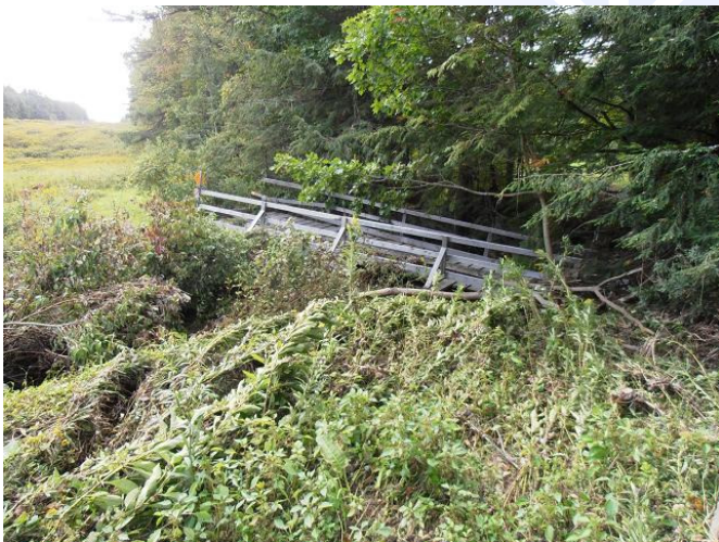
Route 146 bridge came to rest 500 yards downstream. It is on the 'to-do' list.

The Club has ordered 200 new sign posts and should have them by month's end.