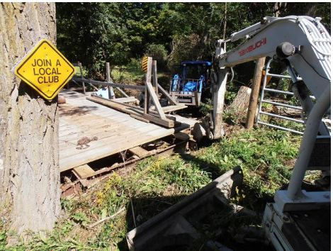
The heavy equipment pull the bridge back straight.