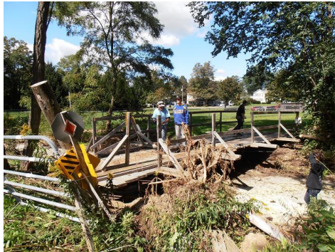
The Knox Ball Park bridge is inspected for flood damage.