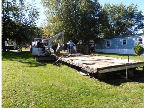
Once a home, now on its way to becoming a bridge.