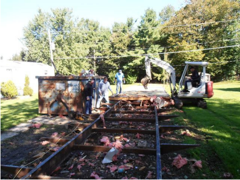
A donated trailer frame is cleared of flooring by club members.