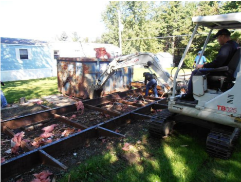
Ron S. cuts the frame to size while Brian B. holds the frame up.